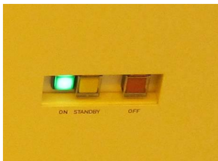
Figure 2: On, stand-by and off button on e-line.