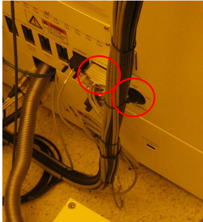
Figure 3: Airlock d-sub plug and power turn-switch.