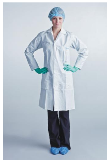
Figure 1: Example of correct dressing.