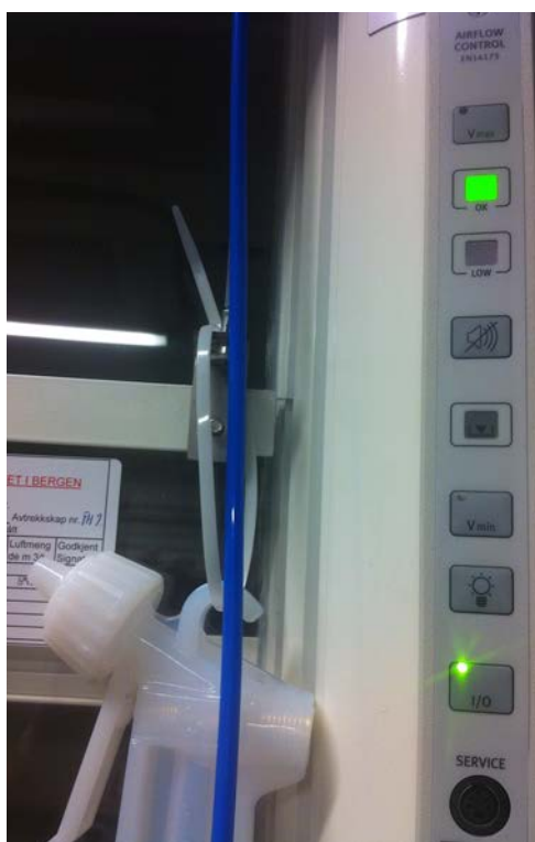
Figure 6: Airflow control panel.

A piece of tissue is attached on the inside of the sash. It can be used as an indicator, if there is airflow in the cabinet. If the fume hood has been restarted (after e.g. power failure), check that the airflow has been restored and keep the sash down for at least 5 minutes to dispose any vapours accumulated in the hood before any work is carried out inside.