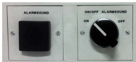
Figure 5: Neutraliser drainage alarm (ON/OFF).

Turn the switch to OFF to mute the alarm signal. After the yellow light disappears turn the switch back to ON.