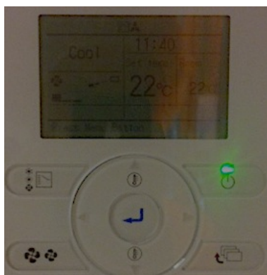
Figure 7: Air condition control panel.

New air is let into the lab by two means, one from the central air condition in the institute supplying the part of the lab where the e-Line is situated. The second part of the lab is supplied from a standalone unit placed in the basement. This filters and controls the air for the second part of the lab including the cleanrooms. Additionally there are four air conditioners cooling the lab air. These are located in the storage room, one in each lab section and one in over the cleanroom cabin. These are operating when the green light is shining, as seen in Figure 7.