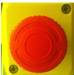
Figure 2: Emergency button to open the doors.