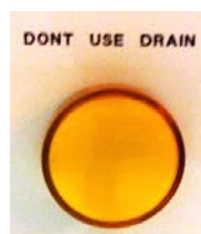
Figure 4: Warning light for neutralizer.

If the following yellow light (Figure 4) is on no more wastewater should be sent through the drains of the sinks! The light will disappear, when the reservoir has been processed by the neutraliser (unit is stored in room 168), and is ready to be used again.